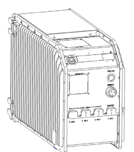
EXPLORER GX Base Unit